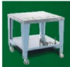
Table: 800 x 800 x 850 (LWH) provided with reaching castors.

Magnetic Base: 200 x 125 x 125 (LWH) For quickest mounting of 'Tap Easy' on larger work